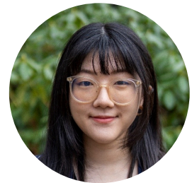
Hiro Ito Patient-Oriented Research