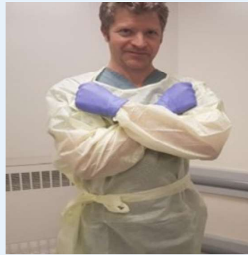
2. Cross your arms to grab the gown and pull forward so the neck straps break away. Avoid touching skin.