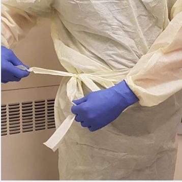
1. Untie the side tie.