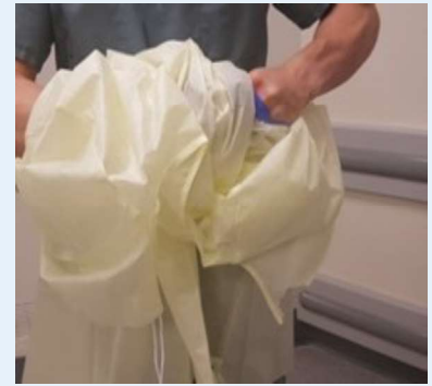
3. Using a rolling motion, grab the exposed side of the sleeve and glove on one arm to remove both in one motion.