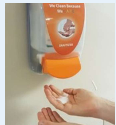
9 Perform Hand Hygiene.