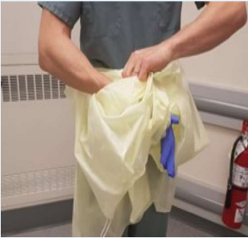
4. Remove the other sleeve and glove with your free hand, only touching the inside of the gown.