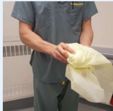
5. Continue rolling gown away from the body until removed. Dispose in the garbage.