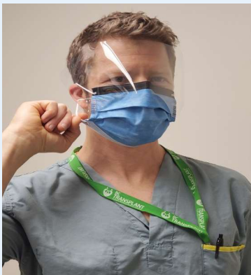
7. If wearing a mask, use clean hands to grab the ear loops and pull the mask away from the face.