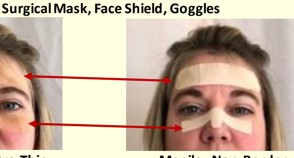
Thin Mepilex Non-Border