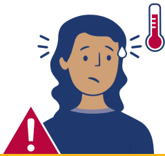
Fever or chills

If you have any of the following symptoms, you could be contagious. Please inform a health care provider as soon as possible.