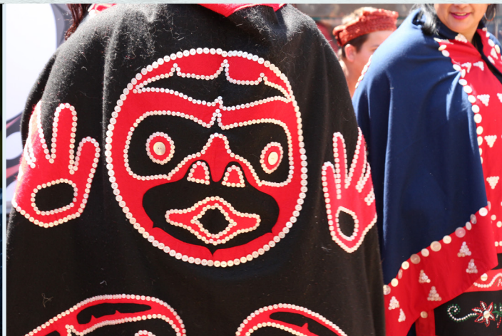
Indigenous Peoples' Day in Kwakwaka'wakw traditional territory