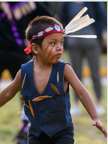
A Tzinquaw dancer

Yes, you can ask our registration staff to remove or update your self-identification at any time.