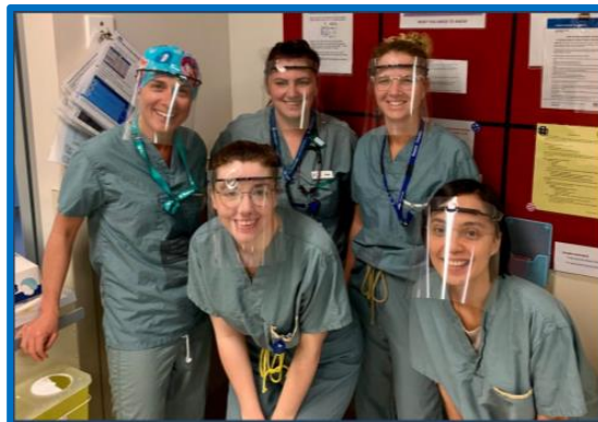
Island Health New Graduate Nurses

Submit your Provisional Licence Application as soon as instructed to do so by your school. Late applications can delay start dates.