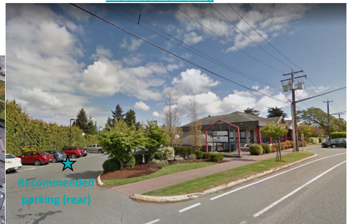
Entrance and Parking