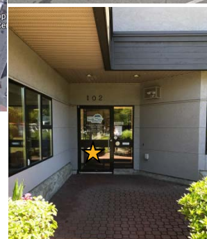
Main entrance of the Health Unit (in the rear of the building – Unit 102)