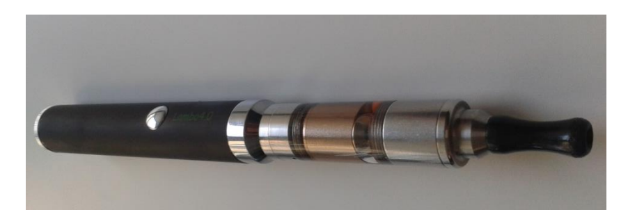
This file is licensed under the Creative Commons Attribution-Share Alike 3.0 Unported license. Attributed to Witzman

3) Pen Rechargeables. Pen rechargeables, or mid-size e-cigarettes, are larger than cigarette rechargeables and look more like a large pen or a small cigar than a cigarette. They can hold more liquid than the cigarette-shaped e-cigarettes and you can fill the cartridge yourself rather than purchasing pre-filled cartridges. The battery is rechargeable and possibly replaceable. Brand names include V2 and Ruyan.