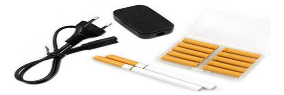
This file is licensed under the Creative Commons Attribution-Share Alike 4.0 International license. Attributed to Vapencity

2) Cigarette Rechargeable. These e-cigarettes, like the disposables, may closely resemble cigarettes, sometimes even coming with an LED at the tip which lights up when you inhale. They are rechargeable and you can purchase pre-filled replacement cartridges, which may or may not contain nicotine. Brand names include Blu, Halo, Greensmoke and EonSmoke.