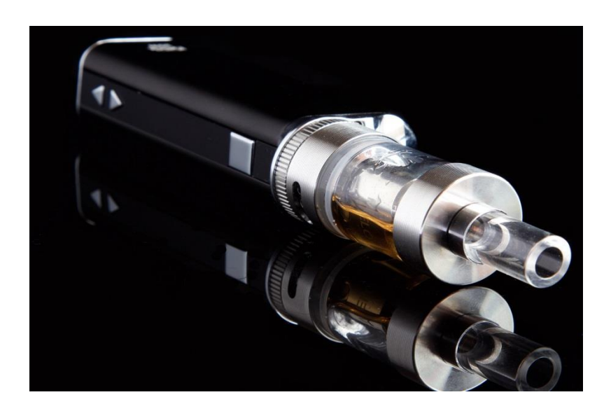
This image is released under Creative Commons. If used, please attribute to <a href="www.ecigclick.co.uk">www.ecigclick.co.uk</a>.

4) Tanks. Tanks are large e-cigarettes, with a rechargeable battery and a large, refillable cartridge. They are also considered easier to modify. Brands include Vaporzone, Aspire and eClear.