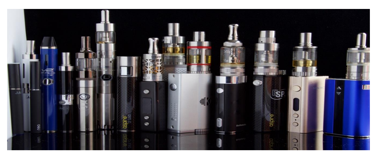
This file is licensed under the <u>Creative Commons Attribution-Share Alike 2.0 Generic</u> license. <u>E Cigarettes, Ego, Vaporizers and Box Mods, Ecig Click</u>