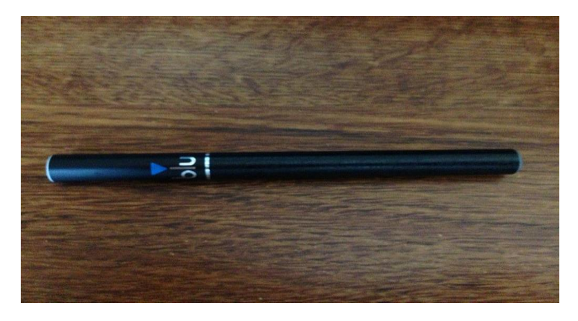
This work is licensed under the <u>Creative Commons Attribution-ShareAlike 3.0</u> License. Attributed to <u>GamblinMan22</u>

1) Disposable . These are cigarette-shaped e-cigarettes in which the battery, cartridge, atomizer and liquid are all integrated into a single, sealed unit. These e-cigarette are intended to be used until the liquid runs out, at which point they are to be discarded. They are non-rechargeable. The liquid in disposables may or may not contain nicotine. Brand names include NJOY, OneJoy, Aer disposables and Flavor Vapes.