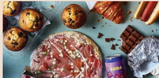
Limit foods high in sodium, sugars or saturated fat